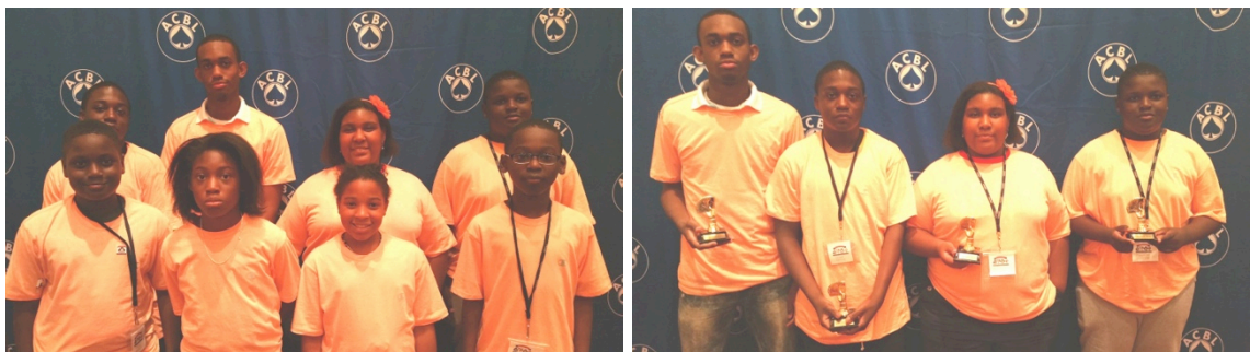
Pictured: Park Avenue School traveling Bridge team members.