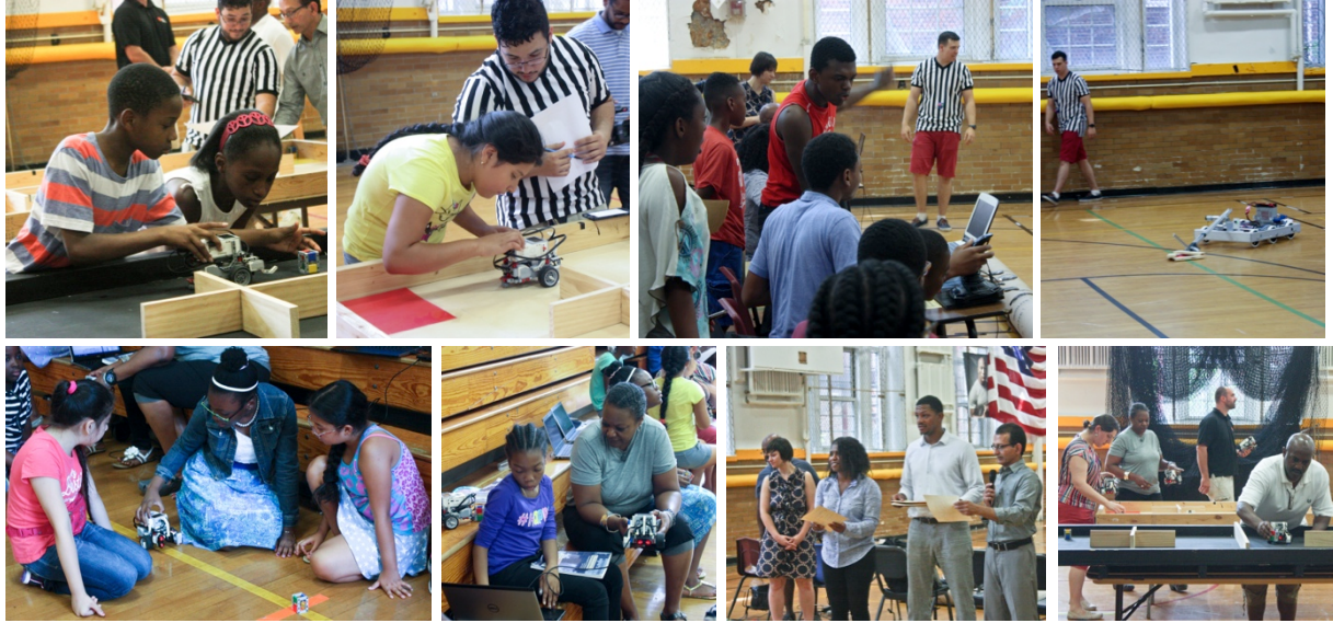
Pictured: Scenes from the Summer Robotics Program's culminating event.