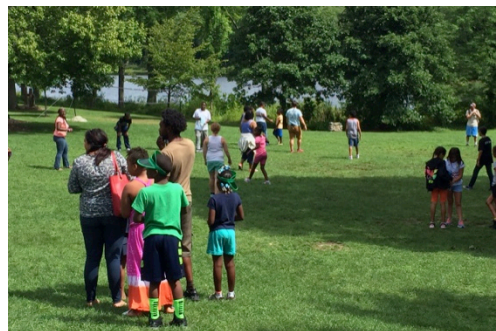
Pictured: Scenes from the Princeton-Blairstown Center in Blairstown.