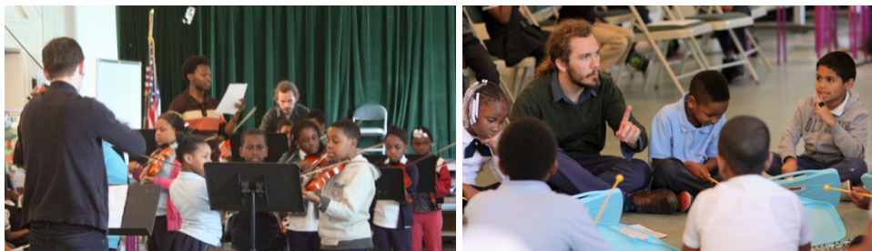
Pictured: Sonic Explorations during their final concert for the 2015-2016 school year at Oakwood Avenue Community School.