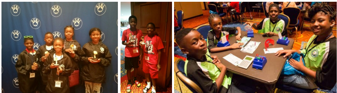
Pictured: The traveling Bridge team members from Oakwood Avenue Community School.

There are 26 youth who attend Oakwood's Community Bridge After School Program. Nine traveled to participate in the nationals. Park Avenue School has 24 students involved in their Bridge Club and 8 traveled to compete. Members of the team were interviewed by The Washington Post , as well as Sports Illustrated for Kids .